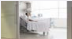
Biomedical & Health