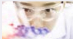
Research & Development