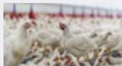
Food / Pharma / Veterinary / Industry