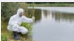
Pollution & Environment