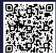
Discover our solutions