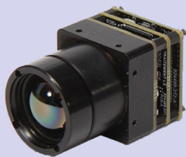
Core camera with 13.6mm lens (32° HFoV)